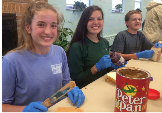
Northwestern Ohio Food Bank;