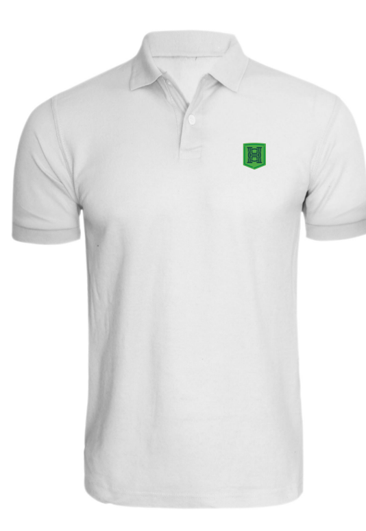
Three-color icon on white shirt

PLEASE NOTE: All apparel items utilizing the OHLS logo or icon require superintendent approval.