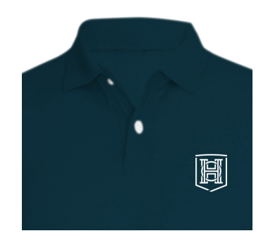
One-color (white) icon on blue shirt