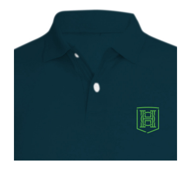
One-color (green) icon on blue shirt