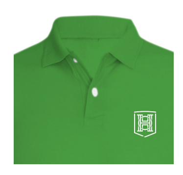
One-color (white) icon on green shirt