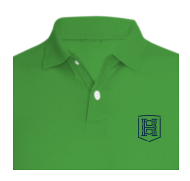
One-color (blue) icon on green shirt